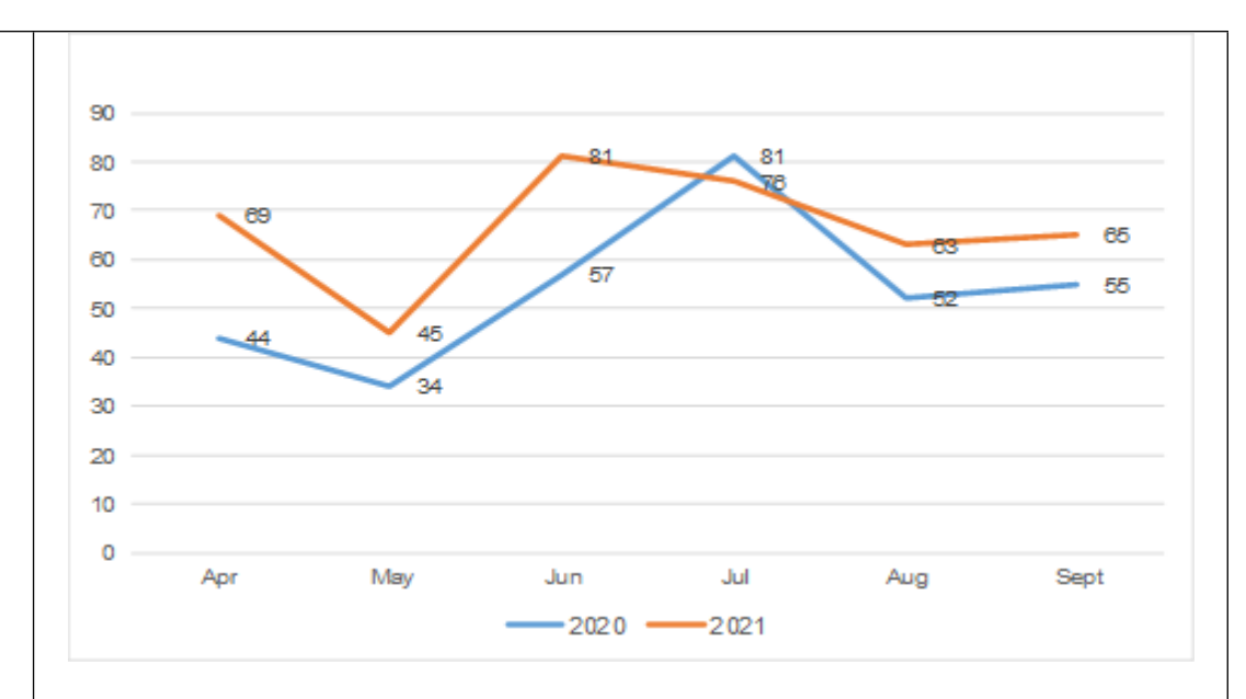
Chart 2 - Complaints by Portfolio 2021